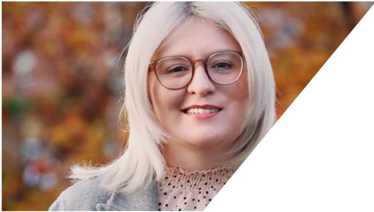
Amy Callaghan Member of Parliament for East Dunbartonshire

Write to: Milngavie Enterprise Centre Ellangowan Court Milngavie G62 8PH